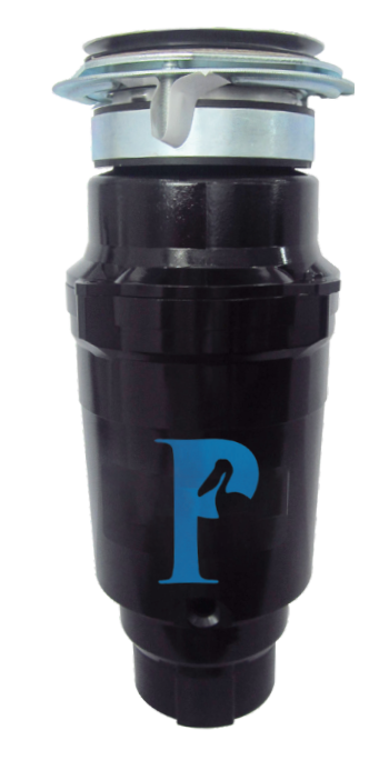
*Air Switch Available Separately*